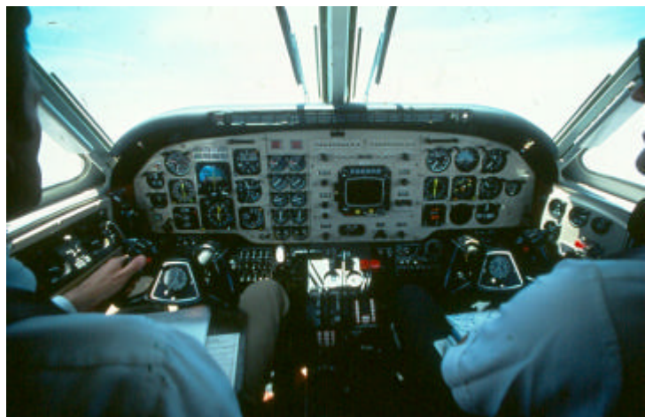
Typical General Aviation IFR Equipment