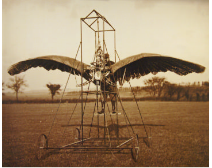
These from the "Weird" Section