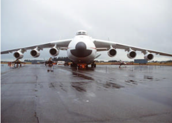
These from the Military Airshow Section