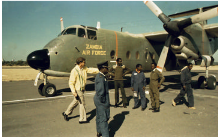
Denis' period with the Zambian Air Force

His presentation also included a look at a typical Military Air Show and the types of aircraft and weapons on display. In conclusion, he included a light-hearted look at some of the "Weird and Wonderful" aircraft that have been designed, built, and sometimes, flown.