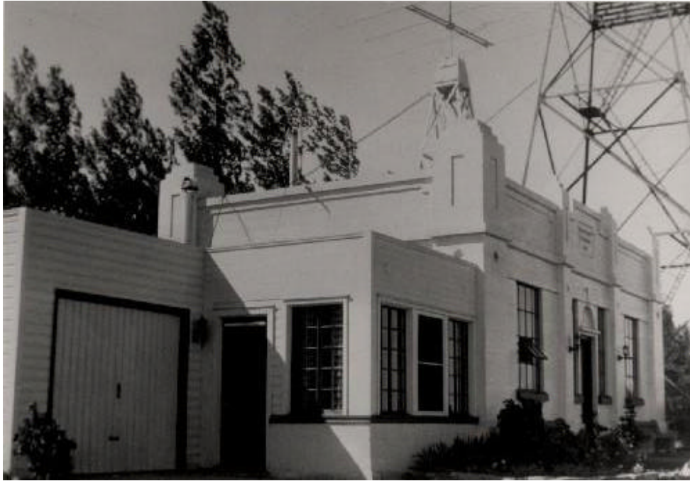
The Port Weller Canadian Coast Guard Lighthouse Circa 1947-53 just before Ethel moved in with her family.

For this picture see: http://www.lieuxpatrimoniaux.ca/visit-visite/image.aspx?id=10486&imgID=0&ver=1&ref=1