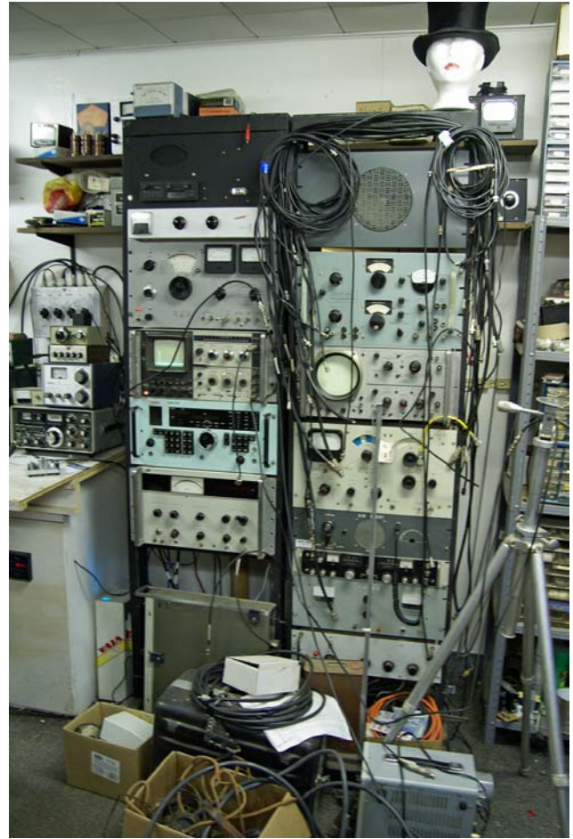
One of David's equipment racks