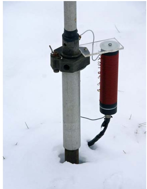
Vertical Antenna Loading Coil